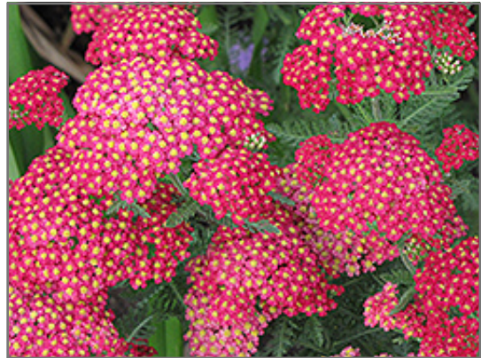
Paprika Yarrow flowers