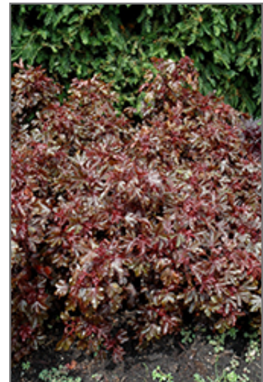
Little Zin Hibiscus