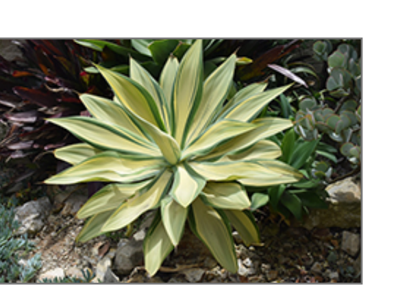
Variegated Fox Tail Agave

your purr-fect garden store Some and so much more