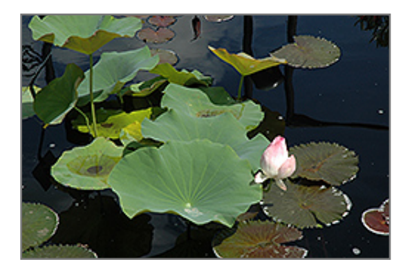
Lotus empress flowers

7711 S. Parker Road Centennial, CO 80016 303.690.4722 www.tagawagardens.com