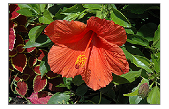
Empire Hibiscus flowers

This plant is native to the tropics and prefers growing in moist environments with evenly warm conditions all year round. In our climate, it is usually grown as an outdoor annual in the garden or in a container. If you want it to survive the winter, it can be brought in to the house and provided with special care, and then returned to the garden the following season. In its preferred tropical habitat, it can grow to be around 8 feet tall at maturity, with a spread of 6 feet. However, when grown as an annual or when overwintered indoors, it can be expected to perform differently, and its exact height and spread will depend on many factors; you may wish to consult with our experts as to how it might perform in your specific application and growing conditions.