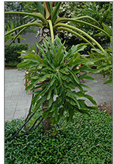
Tree Philodendron foliage