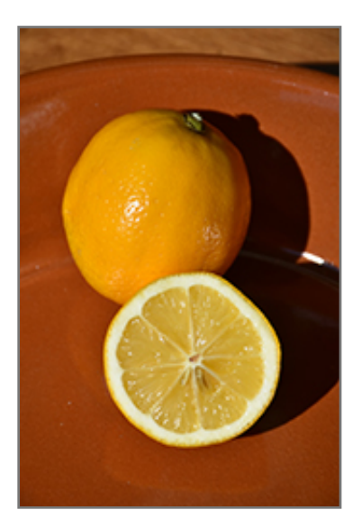
Improved Meyer Lemon fruit

Improved Meyer Lemon features showy clusters of fragrant white star-shaped flowers with buttery yellow eyes at the ends of the branches from early spring to late winter. It has attractive dark green evergreen foliage. The glossy oval leaves are highly ornamental and remain dark green throughout the winter. It features an abundance of magnificent yellow berries from early spring to late winter.