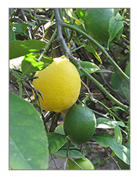
Improved Meyer Lemon fruit