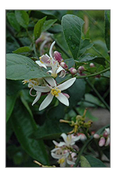
Improved Meyer Lemon flowers

This plant is typically grown in a designated edibles garden. It does best in full sun to partial shade. It prefers to grow in average to moist conditions, and shouldn't be allowed to dry out. It is not particular as to soil type or pH. It is somewhat tolerant of urban pollution. This particular variety is an interspecific hybrid.