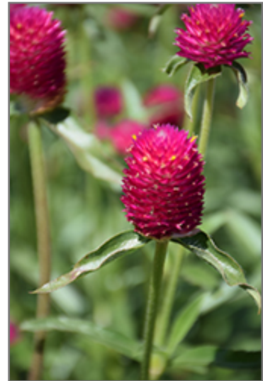
Qis Carmine Gomphrena flowers

Qis Carmine Gomphrena is recommended for the following landscape applications;