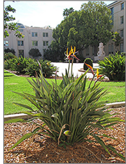
Orange Bird Of Paradise in bloom

Orange Bird Of Paradise is a fine choice for the garden, but it is also a good selection for planting in outdoor pots and containers. With its upright habit of growth, it is best suited for use as a 'thriller' in the 'spiller-thriller-filler' container combination; plant it near the center of the pot, surrounded by smaller plants and those that spill over the edges. It is even sizeable enough that it can be grown alone in a suitable container. Note that when growing plants in outdoor containers and baskets, they may require more frequent waterings than they would in the yard or garden. Be aware that in our climate, this plant may be too tender to survive the winter if left outdoors in a container. Contact our experts for more information on how to protect it over the winter months.