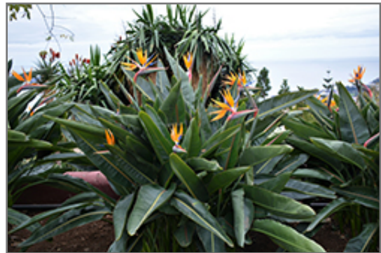
Orange Bird Of Paradise in bloom