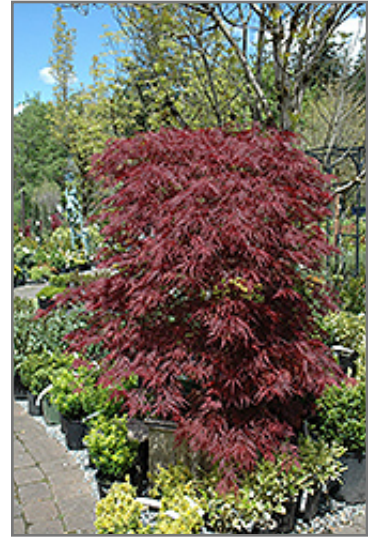
Red Dragon Japanese Maple

Red Dragon Japanese Maple is a fine choice for the yard, but it is also a good selection for planting in outdoor pots and containers. Because of its height, it is often used as a 'thriller' in the 'spiller-thriller-filler' container combination; plant it near the center of the pot, surrounded by smaller plants and those that spill over the edges. It is even sizeable enough that it can be grown alone in a suitable container. Note that when grown in a container, it may not perform exactly as indicated on the tag - this is to be expected. Also note that when growing plants in outdoor containers and baskets, they may require more frequent waterings than they would in the yard or garden.