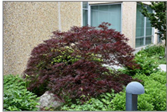
Red Dragon Japanese Maple

This is a relatively low maintenance tree, and should only be pruned in summer after the leaves have fully developed, as it may 'bleed' sap if pruned in late winter or early spring. It has no significant negative characteristics.