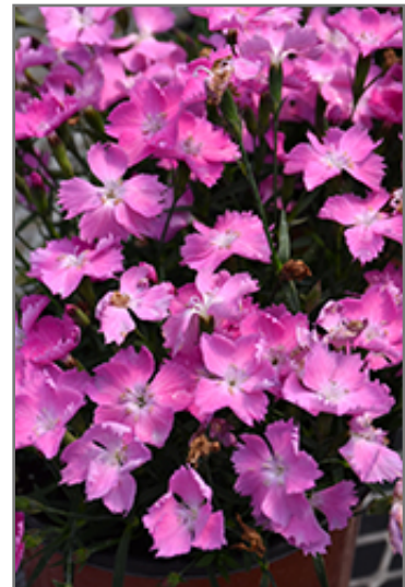
Kahori Pinks flowers