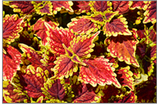
Oxford Street Coleus foliage