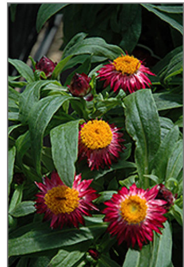
Mohave Dark Red Strawflower flowers