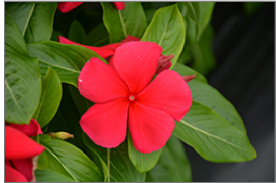
Titan Dark Red Vinca flowers

Titan Dark Red Vinca is recommended for the following landscape applications;