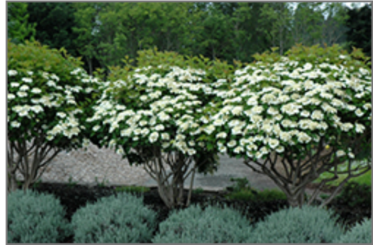
Compact European Cranberry in bloom

This shrub will require occasional maintenance and upkeep, and should only be pruned after flowering to avoid removing any of the current season's flowers. It is a good choice for attracting birds to your yard, but is not particularly attractive to deer who tend to leave it alone in favor of tastier treats. It has no significant negative characteristics.