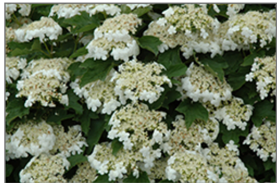
Compact European Cranberry flowers