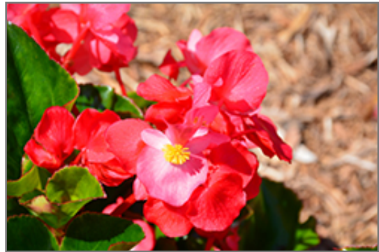
Whopper Rose with Green Leaf Begonia flowers

Whopper Rose with Green Leaf Begonia is recommended for the following landscape applications;