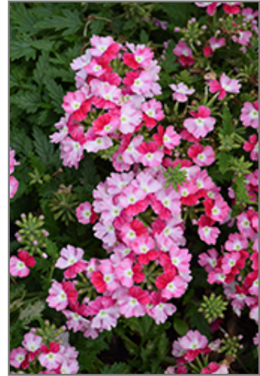
Lanai Twister Red Verbena flowers

Lanai Twister Red Verbena is recommended for the following landscape applications;