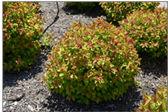
Double Play Big Bang Spirea