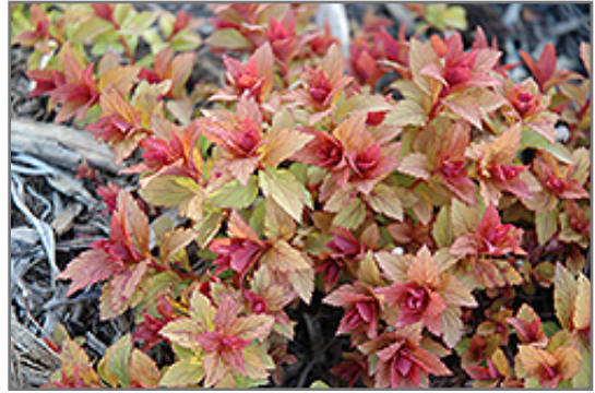
Magic Carpet Spirea foliage

This shrub should only be grown in full sunlight. It prefers to grow in average to moist conditions, and shouldn't be allowed to dry out. It is not particular as to soil type or pH. It is highly tolerant of urban pollution and will even thrive in inner city environments. This particular variety is an interspecific hybrid.