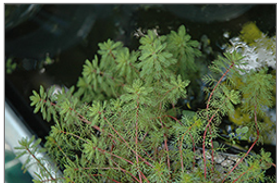
Red Stemmed Parrot Feather foliage