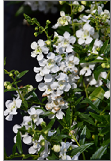
AngelMist Spreading White Angelonia flowers

This plant will require occasional maintenance and upkeep, and should not require much pruning, except when necessary, such as to remove dieback. It is a good choice for attracting butterflies to your yard, but is not particularly attractive to deer who tend to leave it alone in favor of tastier treats. It has no significant negative characteristics.