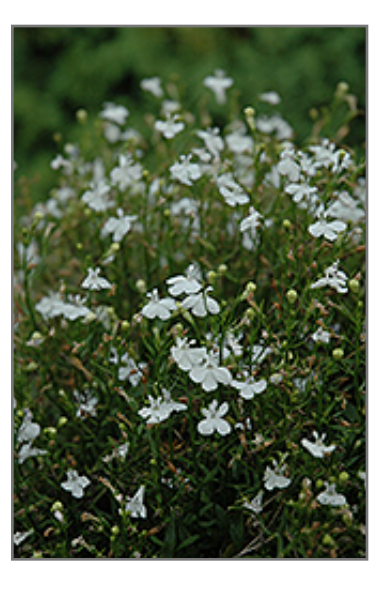
Waterfall White Sparkle Lobelia flowers