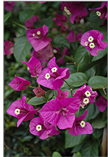
Purple Queen Bougainvillea flowers