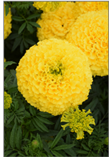
Marvel Yellow Marigold flowers

Marvel Yellow Marigold is recommended for the following landscape applications;