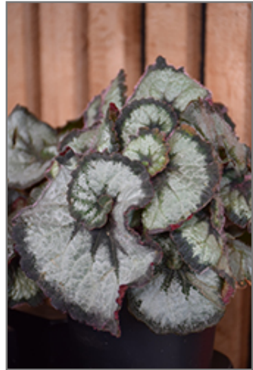
Escargot Begonia foliage