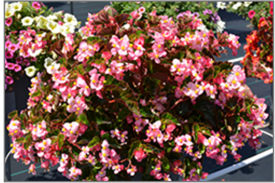
BabyWing Pink Begonia in bloom

BabyWing Pink Begonia is a fine choice for the garden, but it is also a good selection for planting in outdoor containers and hanging baskets. It is often used as a 'filler' in the 'spiller-thriller-filler' container combination, providing a mass of flowers and foliage against which the thriller plants stand out. Note that when growing plants in outdoor containers and baskets, they may require more frequent waterings than they would in the yard or garden.