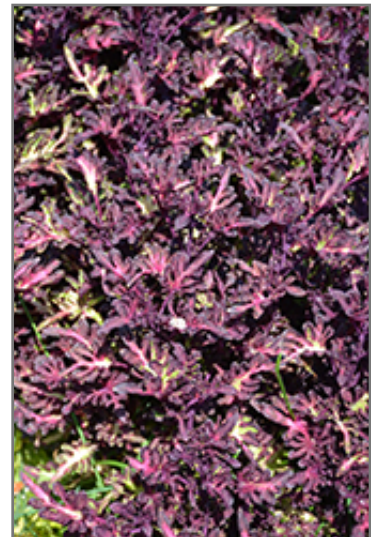
Merlin's Magic Coleus foliage