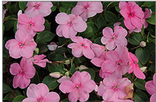
Super Elfin XP Pink Impatiens flowers