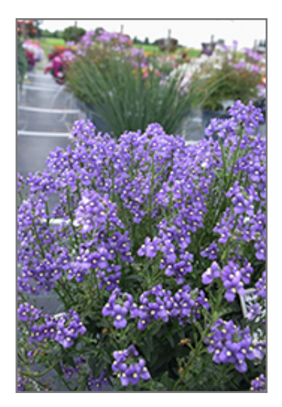
Bluebird Nemesia flowers