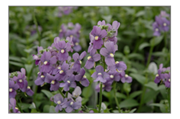
Bluebird Nemesia flowers