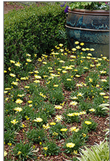
Voltage Yellow African Daisy flowers