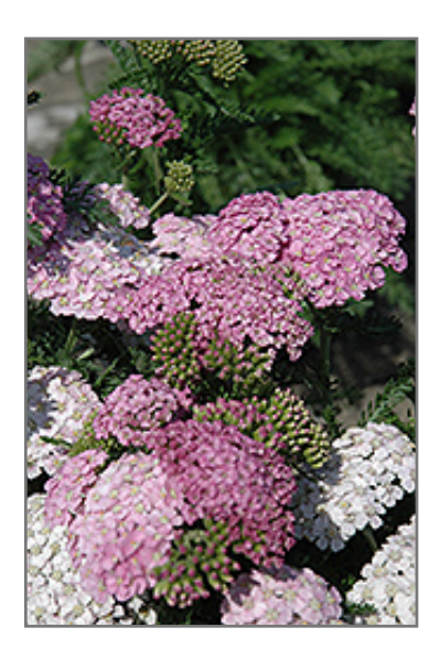
Apple Blossom Yarrow flowers