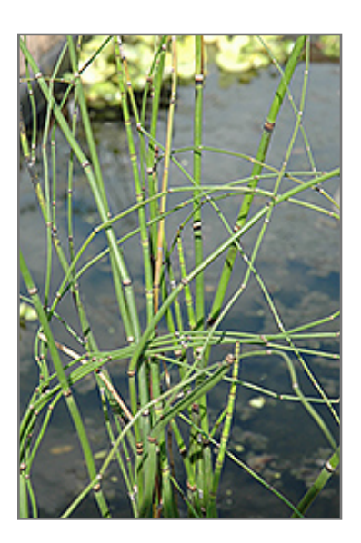
Barred Horsetail foliage

7711 S. Parker Road Centennial, CO 80016 303.690.4722 www.tagawagardens.com