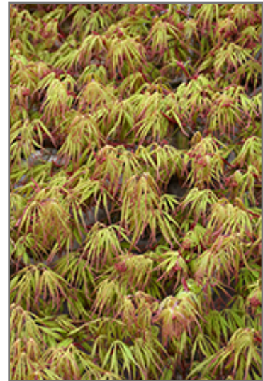
Spring Delight Japanese Maple foliage