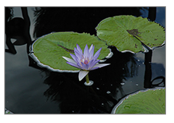
Blue Beauty Tropical Water Lily flowers

Blue Beauty Tropical Water Lily features showy fragrant blue cup-shaped flowers with yellow eyes at the ends of the stems from early summer to late fall. The flowers are excellent for cutting. Its attractive glossy round leaves emerge burgundy in spring, turning dark green in color with distinctive brown spots the rest of the year.