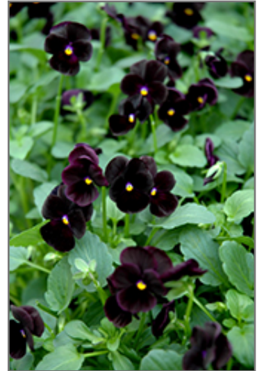
Sorbet Black Delight Pansy flowers

Sorbet Black Delight Pansy is recommended for the following landscape applications;