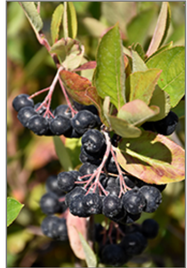
Viking Chokeberry fruit

This shrub does best in full sun to partial shade. It is an amazingly adaptable plant, tolerating both dry conditions and even some standing water. It is not particular as to soil pH, but grows best in clay soils, and is able to handle environmental salt. It is somewhat tolerant of urban pollution. This particular variety is an interspecific hybrid.