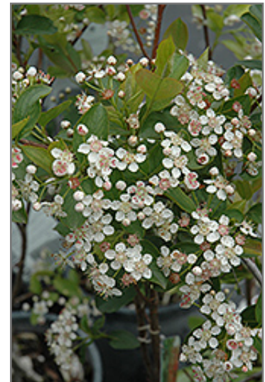
Viking Chokeberry flowers