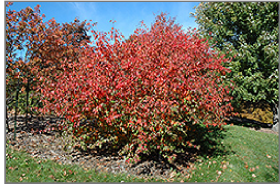
Korean Sun Pear in fall