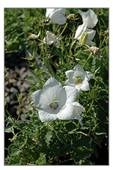
White Uniform Bellflower flowers