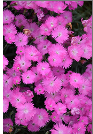
Firewitch Pinks flowers