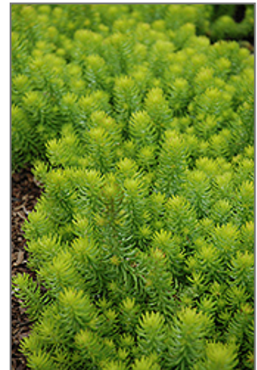
Angelina Stonecrop foliage