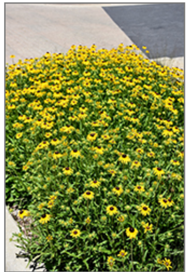
Viette's Little Suzy Coneflower in bloom