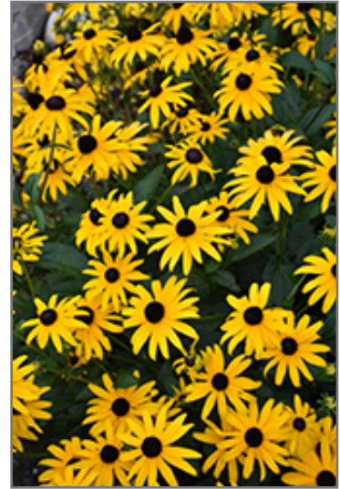
American Gold Rush Coneflower flowers

American Gold Rush Coneflower is an herbaceous perennial with an upright spreading habit of growth. Its medium texture blends into the garden, but can always be balanced by a couple of finer or coarser plants for an effective composition.