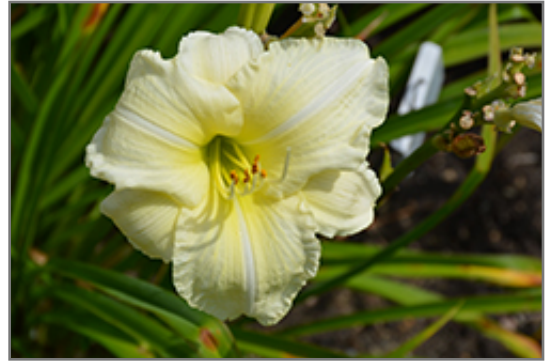
Joan Senior Daylily flowers