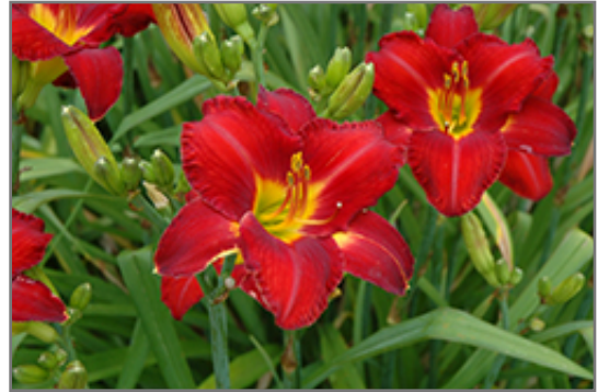
Chicago Apache Daylily flowers