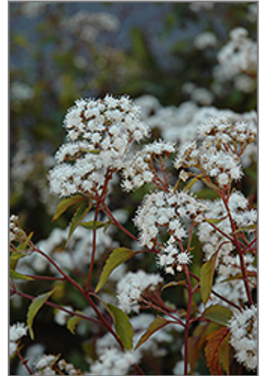
Chocolate Boneset flowers