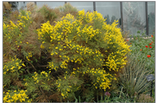
Spanish Broom in bloom