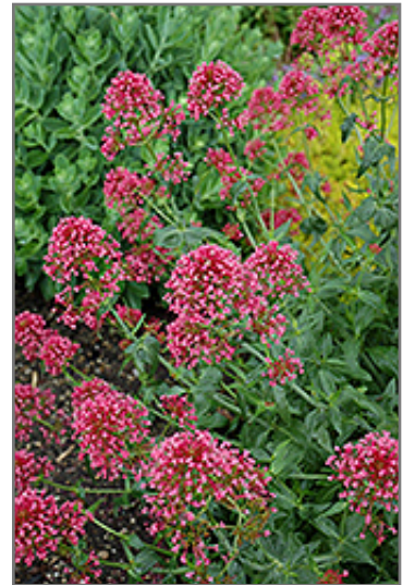
Red Valerian flowers

Red Valerian is recommended for the following landscape applications;