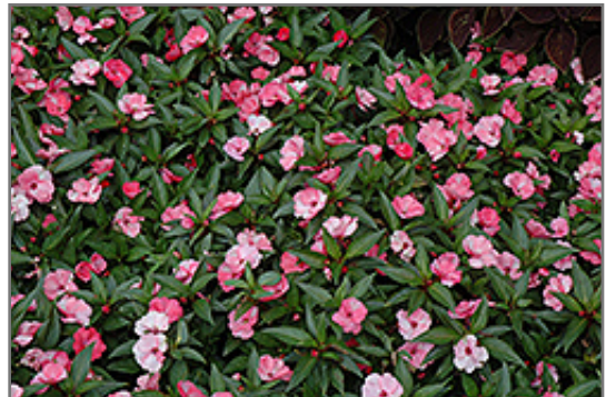
SunPatiens Spreading Pink Flash New Guinea Impatiens in bloom