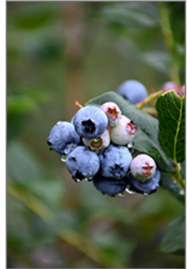
Chippewa Blueberry fruit

Chippewa Blueberry features dainty clusters of white bell-shaped flowers with shell pink overtones hanging below the branches in mid spring. It has green deciduous foliage. The glossy oval leaves turn an outstanding orange in the fall. It features an abundance of magnificent blue berries in mid summer.