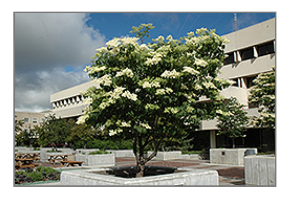
Ivory Silk Japanese Tree Lilac in bloom

7711 S. Parker Road Centennial, CO 80016 303.690.4722 www.tagawagardens.com