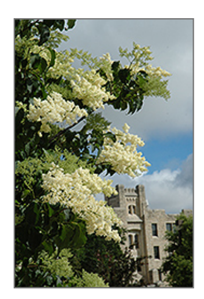
Ivory Silk Japanese Tree Lilac flowers